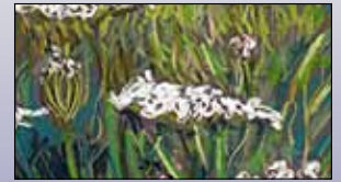
Drawing from Nature