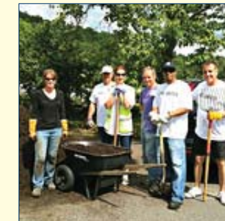
Above: Pitney Bowes employee volunteers