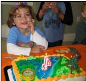
Birthday parties...see page 1.

Box 116 • 101 Marchant Road • West Redding, CT 06896