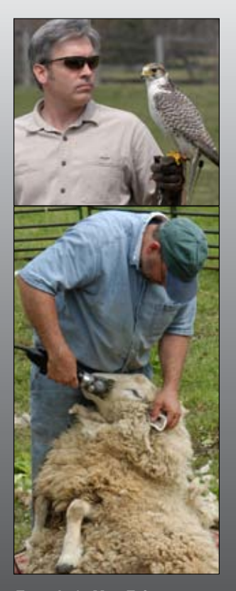
Founder's May Fair Saturday, May 17 Details on this page.