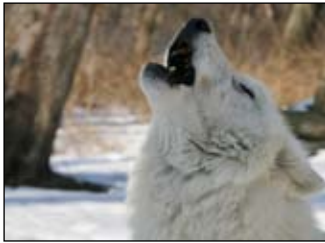
Wolves of North America March 22, 2 p.m.

New Pond Farm Education Center Box 116 • 101 Marchant Road West Redding, CT 06896