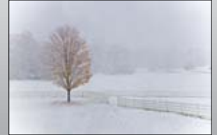
Photographing the Redding Landscape: