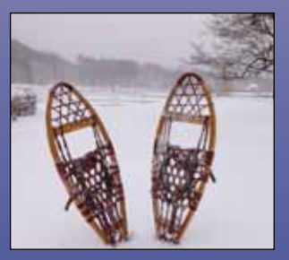
"Open to Members" on page 4

click on any title or photo or call the office (203) 938-2117