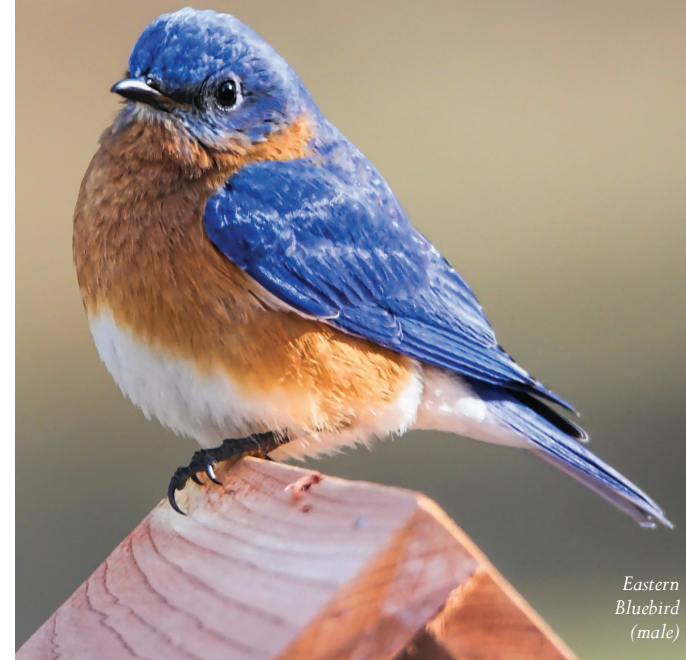
Eastern Bluebird (male)

On every acre, in all we do, we plant seeds for a lifetime of active engagement with the natural world.