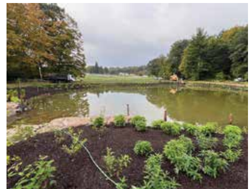
The newly restored wetland ecosystem with native plantings that will improve biodiversity and enhance freshwater ecology programming