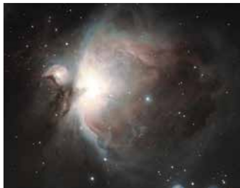
The Orion nebula. Image taken with our brand new smart telescope that enables us to capture fascinating images from deep space.